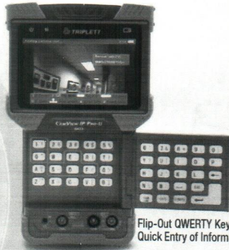
Flip-Out QWERTY Keyboard for Quick Entry of Information